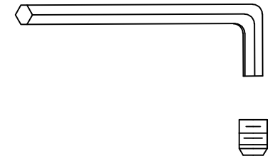
Tiny Hex Bolts